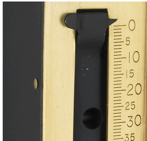
Easy to read graduations