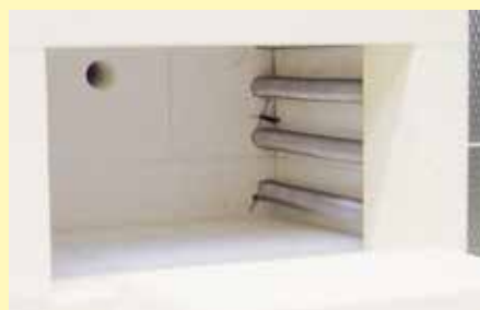
Furnace lining with high-quality lightweight refractory brick insulation