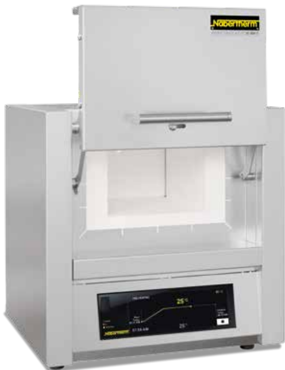
Muffle furnace LT 5/12 with lift door

The muffle furnaces L 1/12 - LT 40/12 have been proven for daily laboratory use. These models stand out for their excellent workmanship, advanced and attractive design, and high level of reliability. The muffle furnaces come equipped with either a flap door or lift door at no extra charge.