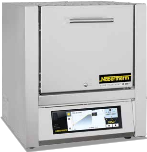
Muffle furnace L 3/12