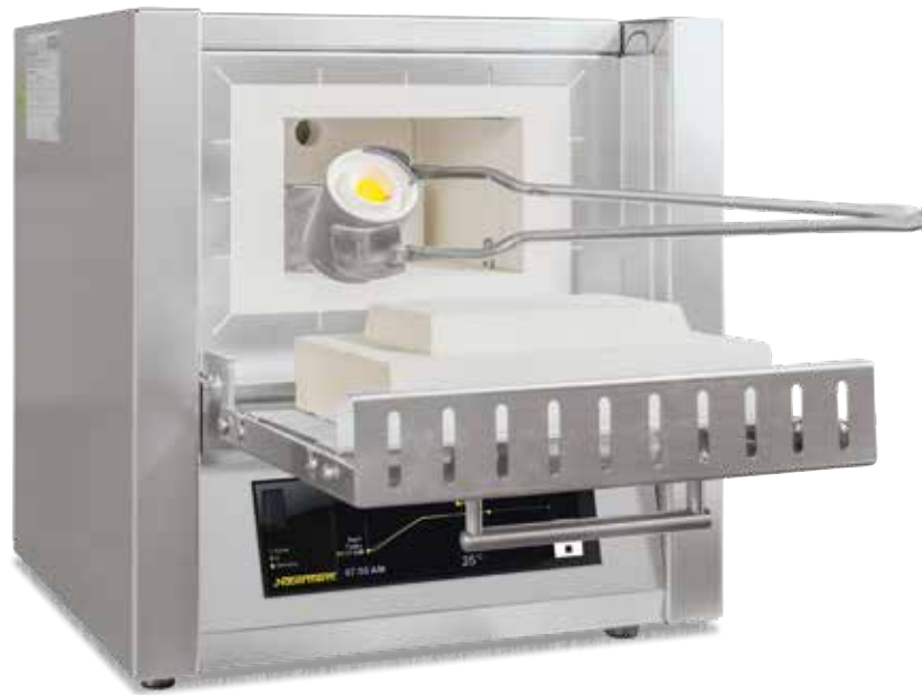
Muffle furnace L 3/11 with flap door