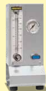
Gas supply system for non-flammable protective or reactive gas