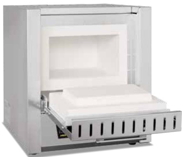
Muffle furnace L 9/11/SKM with flap door

We particularly recommend the muffle furnace L 9/11/SKM for heat treatment of aggressive substances. The furnace has a ceramic muffle with embedded heating from four sides. The muffle furnace thus combines a very good temperature uniformity with excellent protection of the heating elements from aggressive atmospheres. Another aspect is the smooth, nearly particle free muffle (furnace door made of fiber insulation), an important quality feature.