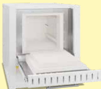
Muffle furnace LE 14/11