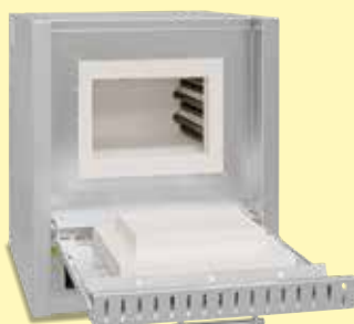
Muffle furnace L 9/14 with flap door

*Please see page 75 for more information about supply voltage