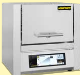
Muffle furnace LT 5/13 with lift door

*Please see page 75 for more information about supply voltage