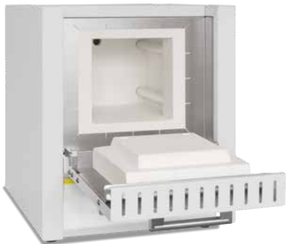
Muffle furnace LE 6/11

With their convincing price/performance ratio and the fast heat-up rates, these compact muffle furnaces are perfect for many applications in the laboratory. Quality features like the dual shell furnace housing of rust-free stainless steel, their compact, lightweight constructions, or the heating elements encased in quartz glass tubes make these models reliable partners for your application.