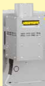
Chimney with fan