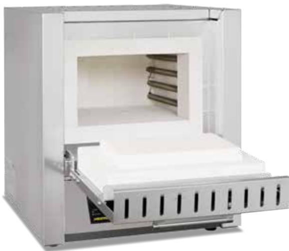
Muffle furnace L 9/13 with flap door

Heating elements on support tubes radiating freely into the furnace chamber provide for particularly short heating times for these muffle furnaces. Thanks to their robust lightweight refractory brick insulation, they can reach a maximum working temperature of 1300 °C. These muffle furnaces thus represent an interesting alternative to the familiar L(T) ../12 models, when you need a higher application temperature.