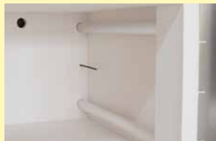
Heating elements protected in quartz glass tubes