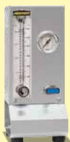
Gas supply system for non-flammable protective or reactive gas