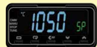
Example of an over-temperature limiter