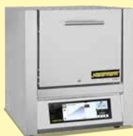
Muffle furnace L 9/11/SKM

*Please see page 75 for more information about supply voltage