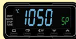
Example of an over-temperature limiter