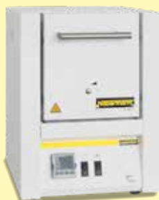
Muffle furnace LE 1/11

*Please see page 75 for more information about supply voltage