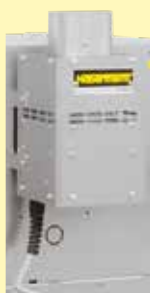
Chimney with fan