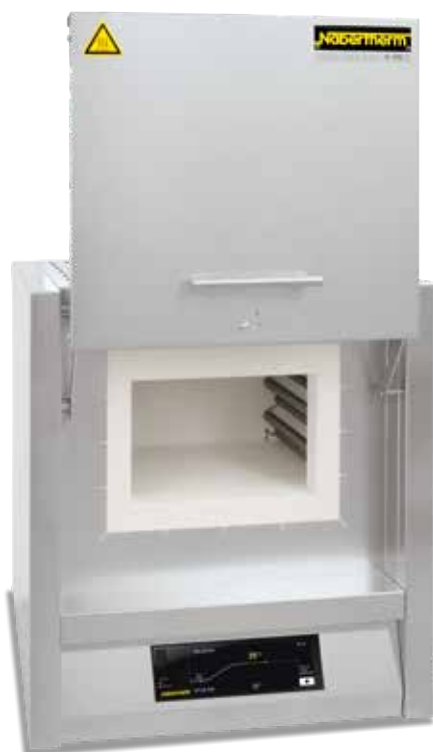
Muffle furnace LT 9/14 with lift door

These models stand out for their excellent workmanship, advanced and attractive design, and high level of reliability. Heating elements on support tubes radiating freely into the furnace chamber provide for particularly short heating times and a maximum temperature of 1400 °C. These muffle furnaces are a good alternative to the familiar L(T) ../12 series when higher application temperatures are needed.