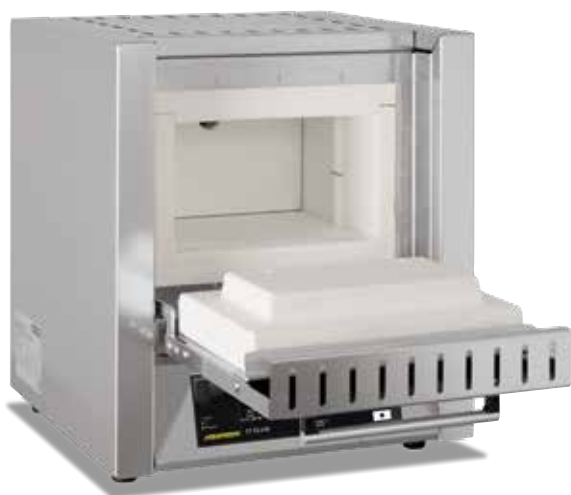
Muffle furnace L 3/11 with flap door