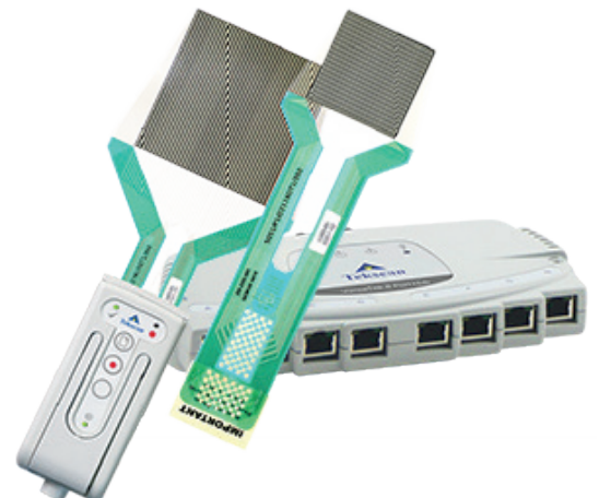
VersaTek™ hub, handle and film