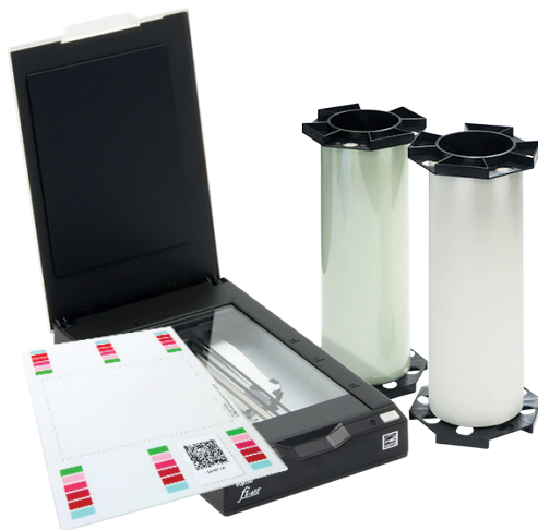
Scanner, calibration-sheet and films

The system is particularly suitable for applications which require very detailed results. The collision pressure is recorded as a „film“. By means of synchronization on the force curve, the pressure values and the pressure distribution can be determined and visualized for the required transient and static pressure. The system will show all four measured values according to ISO/TS 15066. It comprises various film sensors, a handle for picking up the films and a hub (interface). The film sensors can be reused several times and consist of ultra-thin circuit boards with circuits and pressure sensitive cells.