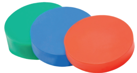
Damping Element K1