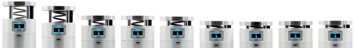
10 N/mm 25 N/mm 30 N/mm 35 N/mm 40 N/mm 50 N/mm 60 N/mm 75 N/mm 150 N/mm

For each of the nine spring constants according to ISO/TS 15066, one aluminum made calibrated force transducer is immediately available and ready for measuring without any further preparation. The heart of the force transducer is the Piezo force sensor with linear-guided measuring mechanism which guarantees optimum measuring accuracy and reproducibility. The force gauge is equipped with integrated electronics for the evaluation and storage of the values measured. The storage capacity is up to 100 single measurements. The transient and quasi-static values are represented via the display. Data are transferred wireless, or alternatively by USB interface. The small dimensions allow easy positioning of the device.